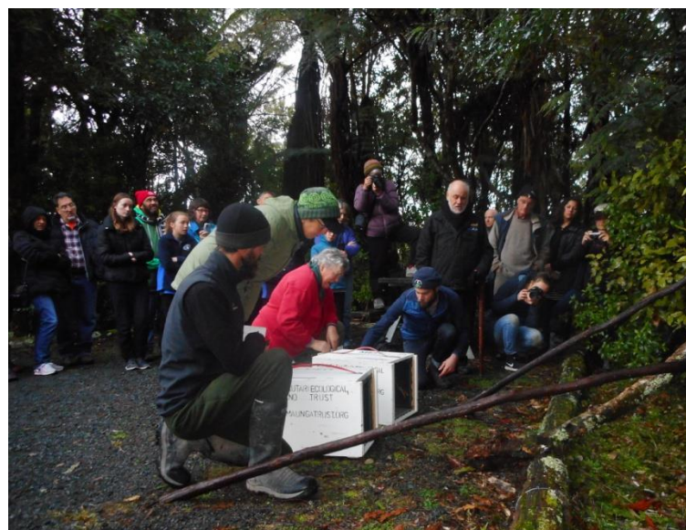
Pirongia lineage kōkako moments from being released

Lastly, huge thanks to the Len Reynolds Trust and RNZ's Critter of the Week for their recent grants. Our facebook page has other news updates.