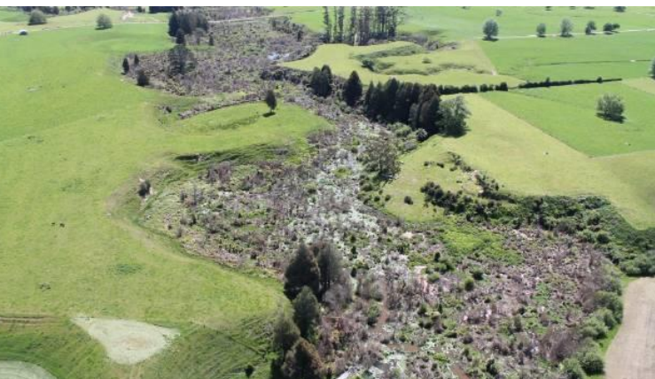
Mangaotama Wetland, in the Waipa catchment is a major wetland restoration project funded by the Waikato River Authority

panel, with the final funding decisions made by the Authority and announced in November. In the past seven years of funding, the Waikato River Authority has allocated $38 million to 250 projects.