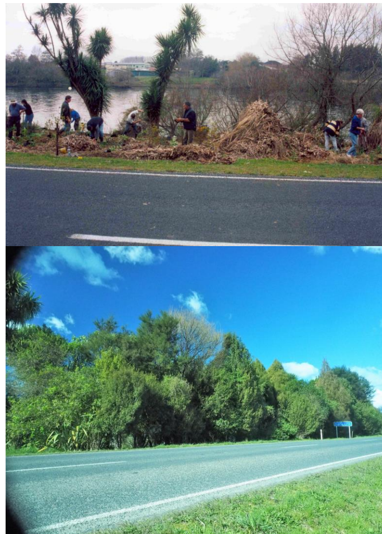
Hakarimata Road before (2001) and after (2018)

With this combination of trees and shrubs most potential weeds will ultimately be shaded out, but control of species which can become pasture pests may be needed until this happens. Otherwise very little maintenance is needed and we will have protected our local biodiversity.