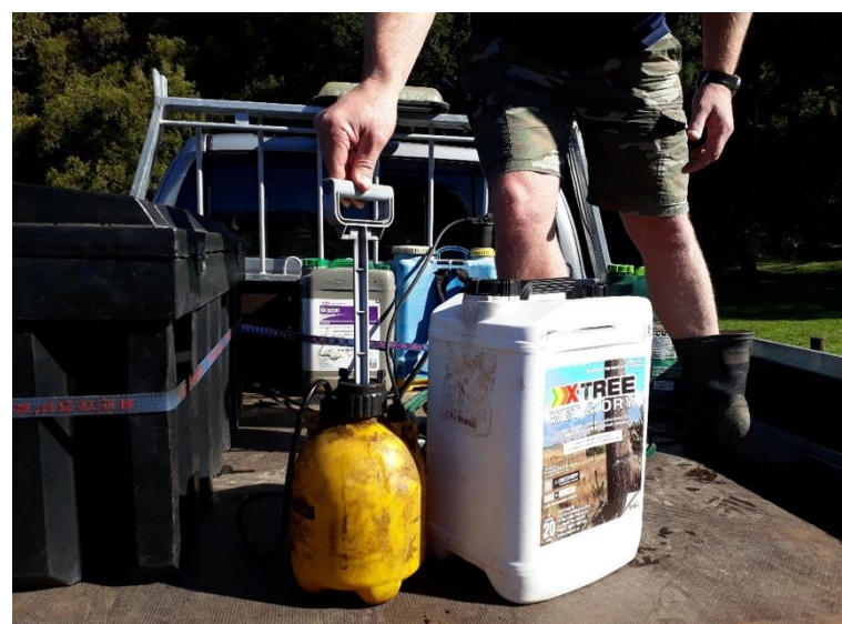
X Tree Basal and an $8- sprayer from The Warehouse – this chemical is harsh on rubber seals.

Ben is available to come and talk to landowners within the Waipa/Central Waikato region about weed control. You can contact him at: ben.elliott@pestplants.co.nz PH: 0274 404 052 / 07 827 4063