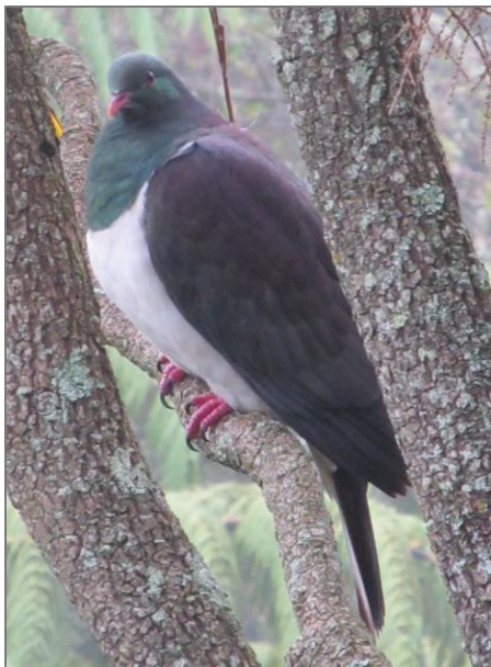
taken at Porritt Stadium, Hamilton

These three species do have some challenges. Nikau is easy to grow from seed but is very slow growing. Tawa and pigeon wood are easy to grow from seed but frost tender when young. Miro is very hard to grow from seed but is frost hard and grows at a reasonable rate for a canopy tree. They have 11 miro already planted and another 32 of varying sizes growing on in their shade house.