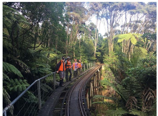
The Driving Creek conservation crew on-track